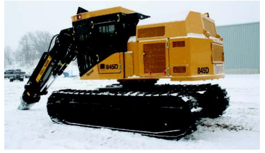
A new Tigercat 845D feller buncher awaits shipment behind the company's factory in Paris, Ontario. Canada.

was equipped with a leveling undercarriage to work steep slopes. The second machine went to Maine. The 845D feller buncher uses a Tier 4 final FPT Industrial N67 diesel engine rated 282 hp at 2200 rpm and is a midsized machine with a limited tailswing design.