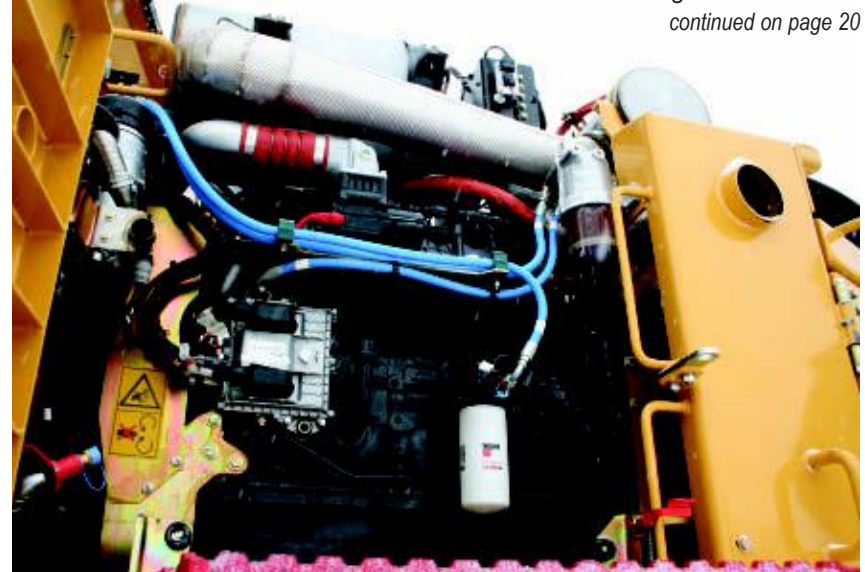
The 845D feller buncher uses a Tier 4 final FPT Industrial NEF N67 diesel engine rated 282 hp at 2200 rpm. The red platform at the bottom of the photo is included on machines with leveling undercarriages to help make regular maintenance safer and easier.

"We are 100% responsible for the engines, and so we need to give our customers the best possible fuel filtration that we can give them so that continued on page 20